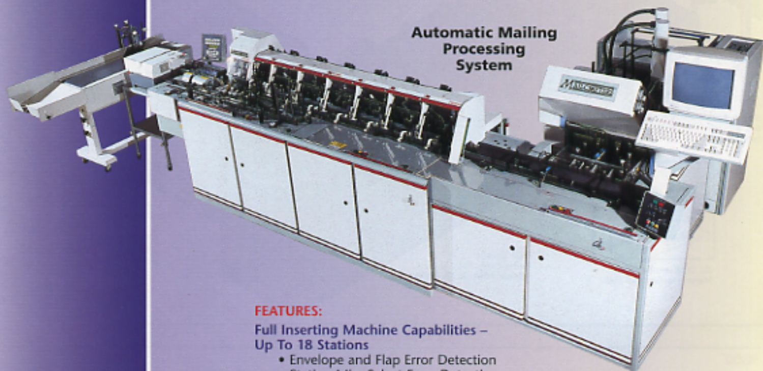
Automatic Mailing Processing System